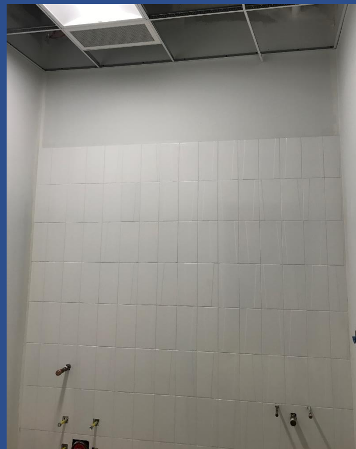
Install of Bathroom Wall Tile