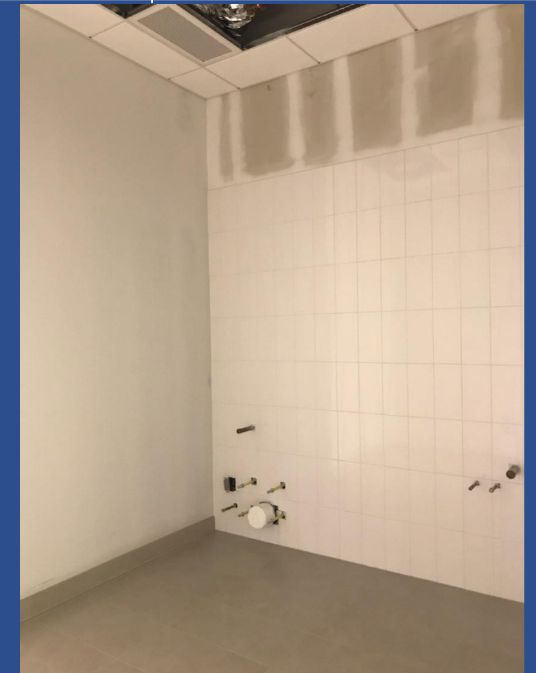
Install of Bathroom Tile