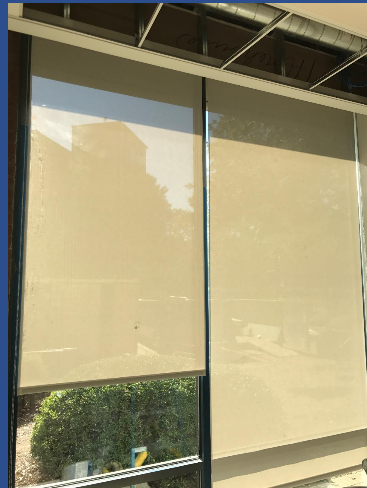
Window Shade Mock Up