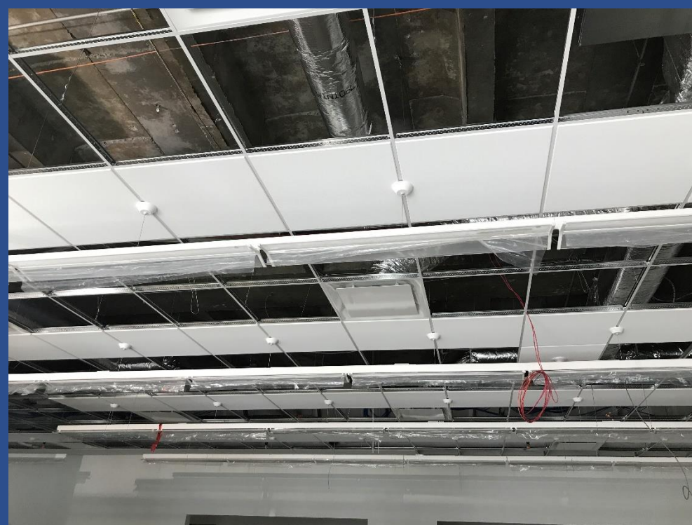
Work Station Light Fixture Install